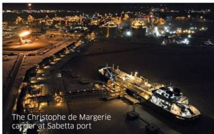
The Christophe de Margerie carrier at Sabetta port